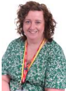
Jane Street is located at: HOY / Pastoral Office: Second Floor